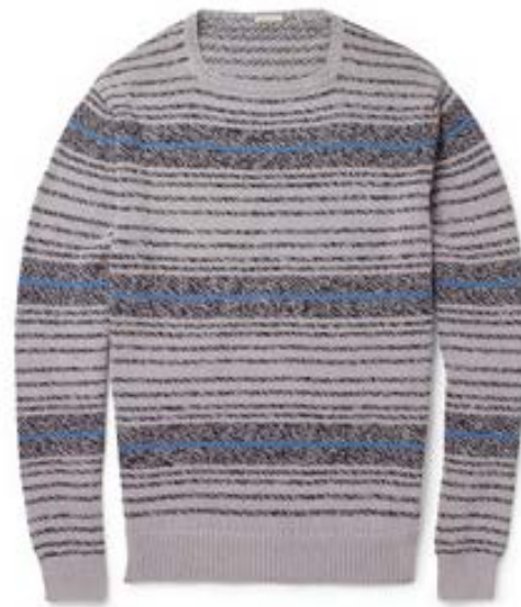
Sweater By Massimo Alba