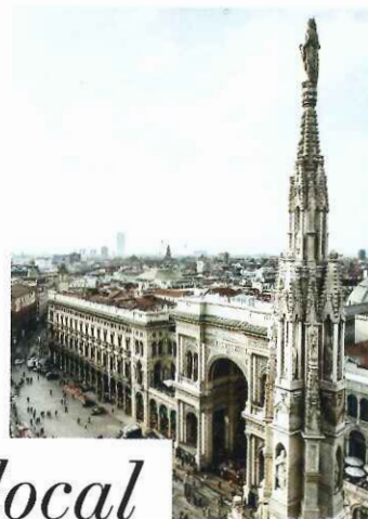
FROM FAR LEFT The courtyard of Rossana Orlandi. Piero Castellini. A view of the city from its cathedral. Fornasetti ceramics (also centre)