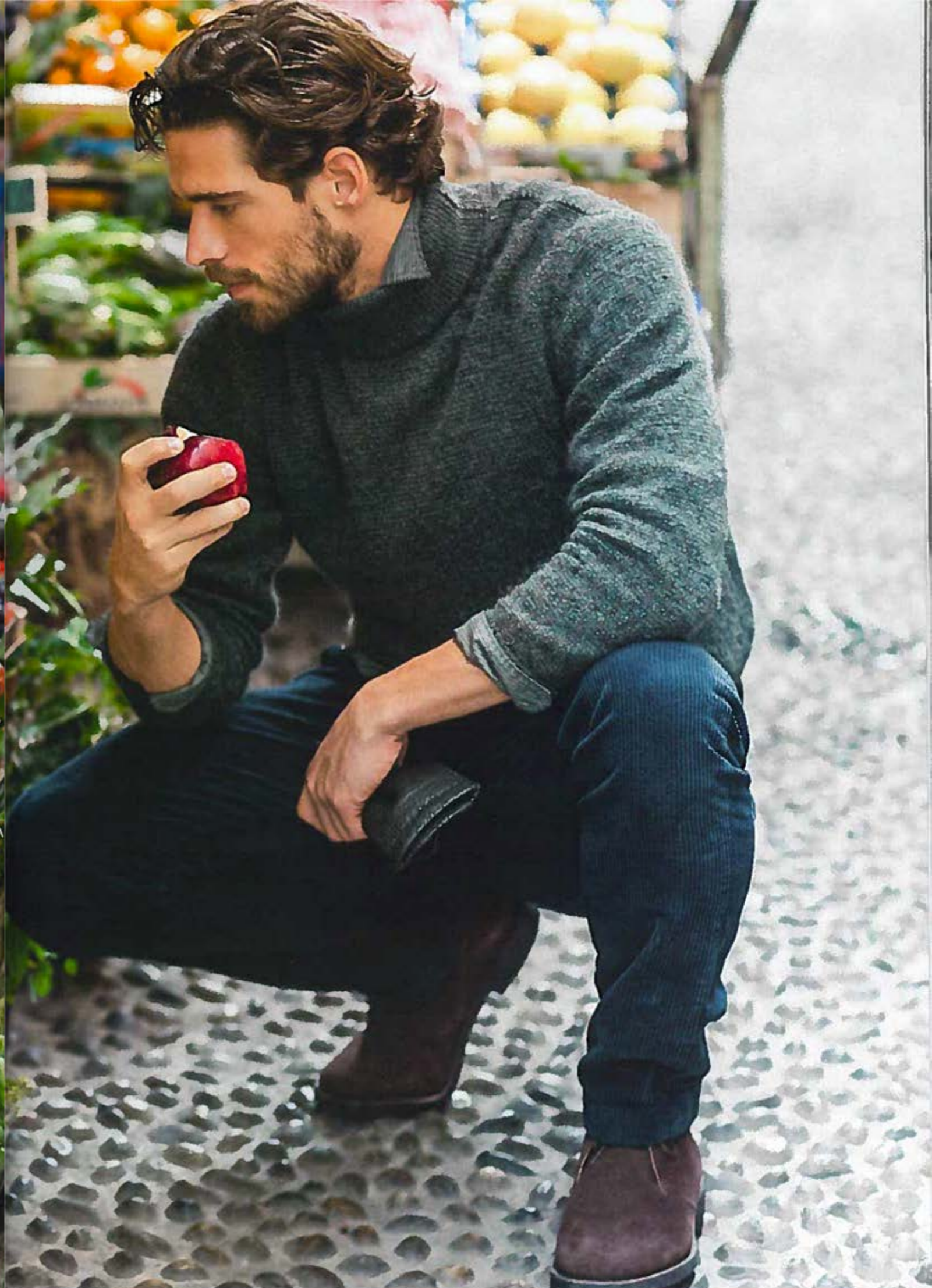
Turtleneck jumper, Massimo Alba Shirt, Massimo Alba Trousers, Massimo Alba Gloves, Mestra Shoes, Church's